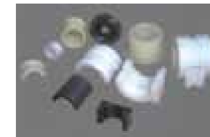
Bushes and Bearings