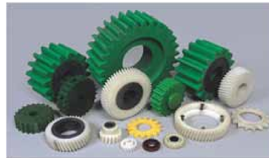
Gear Pinion & Sprockets