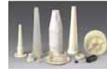
Nylon Moulded Components